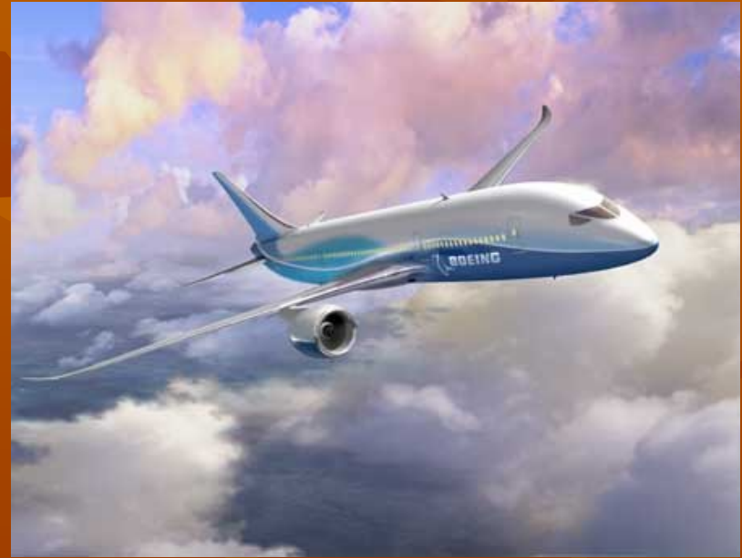
Boeing 787, Dreamliner